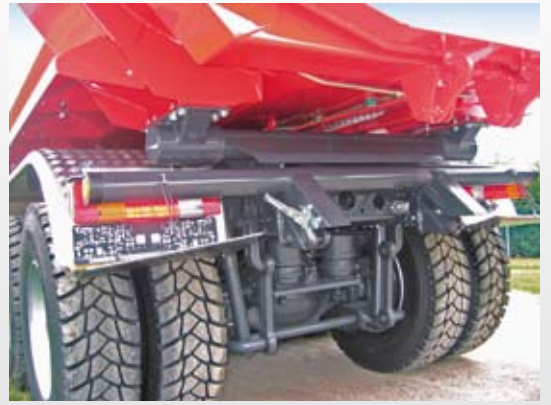
Asphalt-spreader-compatible hinged underride guard