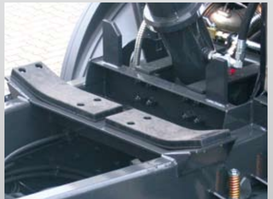
Rubber front body support