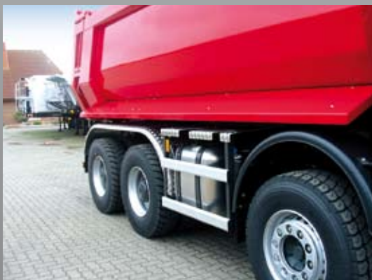
Lateral protection panels