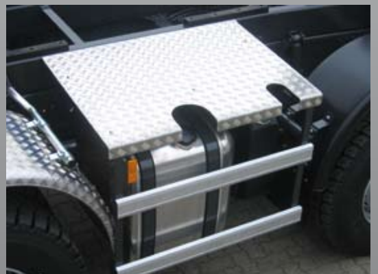
Aluminium checkered panels and lateral underride guard