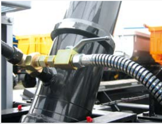
Lock-out valve for hydraulic tailgate